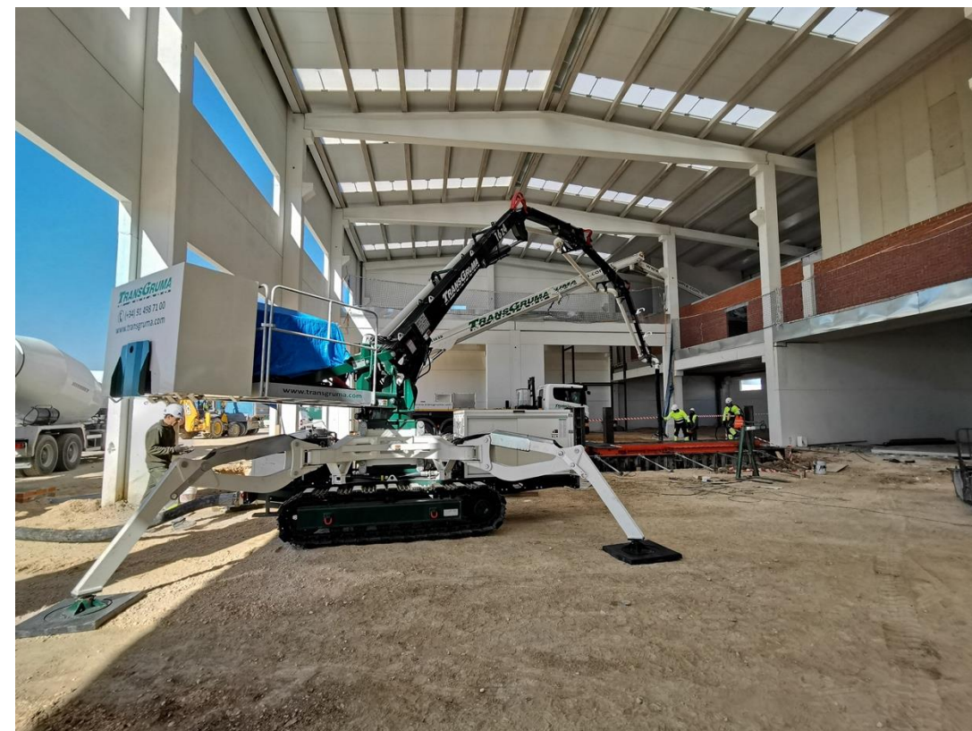
Crawler Hydraulic Distributor