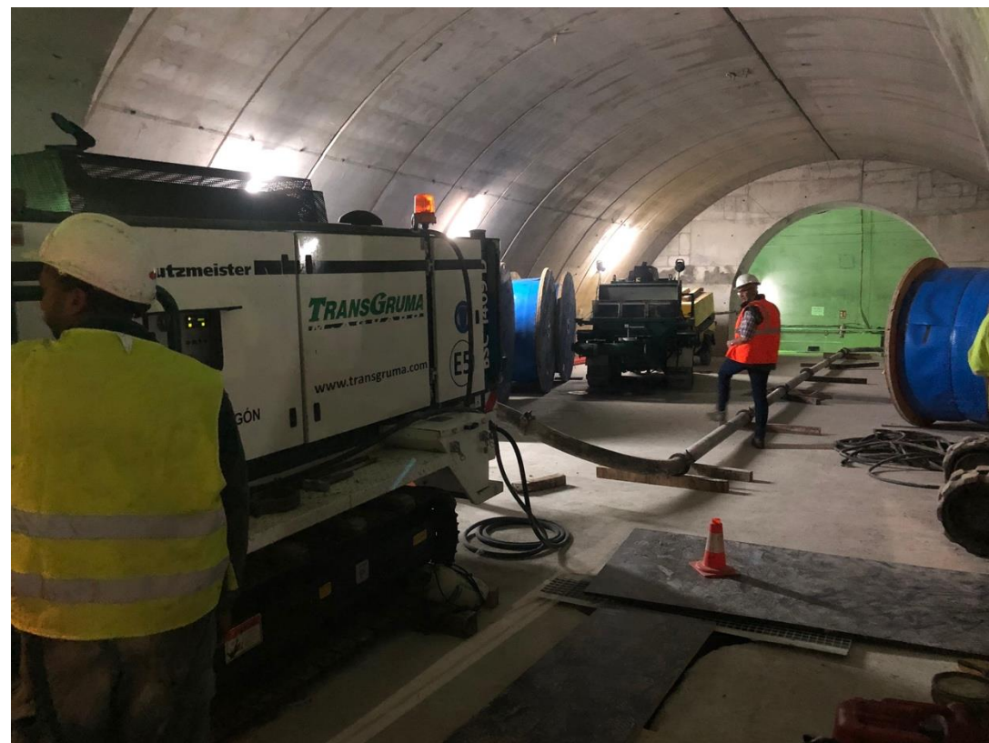
Crawler Static Pump

Special static over crawler equipment for the distribution and pumping of concrete in tight spaces