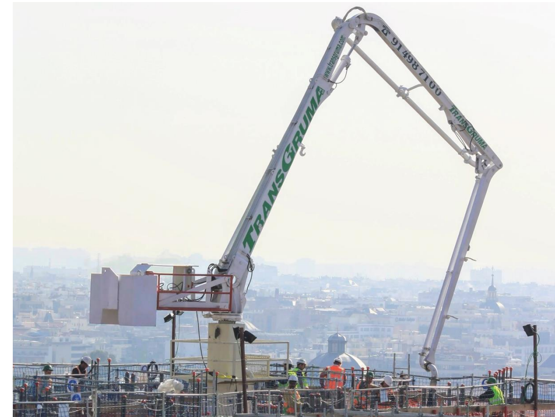
Static Pen on Mast